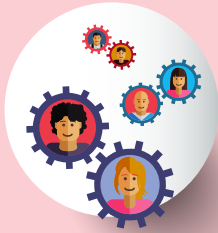
Making the Right Match