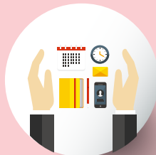
Real-time Tracking Diary