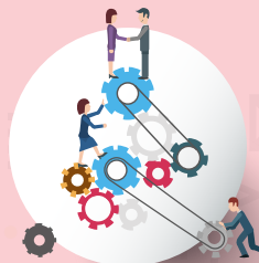
Business Matchmaking Team Assistance